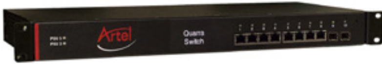
Quarra 1G PTP Ethernet Switch