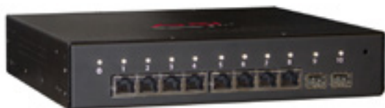
Quarra 1G Compact PTP Ethernet Switch

Port mirroring Port-based access control IEEE 802.3ad : Link aggregation IEEE 802.1x : Network Access Control IEEE 802.1w : Rapid Spanning Tree Protocol IEEE 802.1s : Multiple Spanning Tree Protocol Simple Network Management Protocol (SNMP) Independent and shared VLAN learning 256 VLAN egress tagging TCAM entries Link aggregation traffic distribution is programmable and based on Layer-2 through Layer-4 information Basic Switching - Forwarding, address learning and address aging VLAN IEEE 802.1Q (4,096 VLAN's) - Push / pop / translate up to two VLAN tags; translation in ingress and / or egress 8,192 MAC addresses. Including Generic Attribute Registration Protocol (GARP) Wire-speed hardware-based learning and CPU-based learning configurable per port